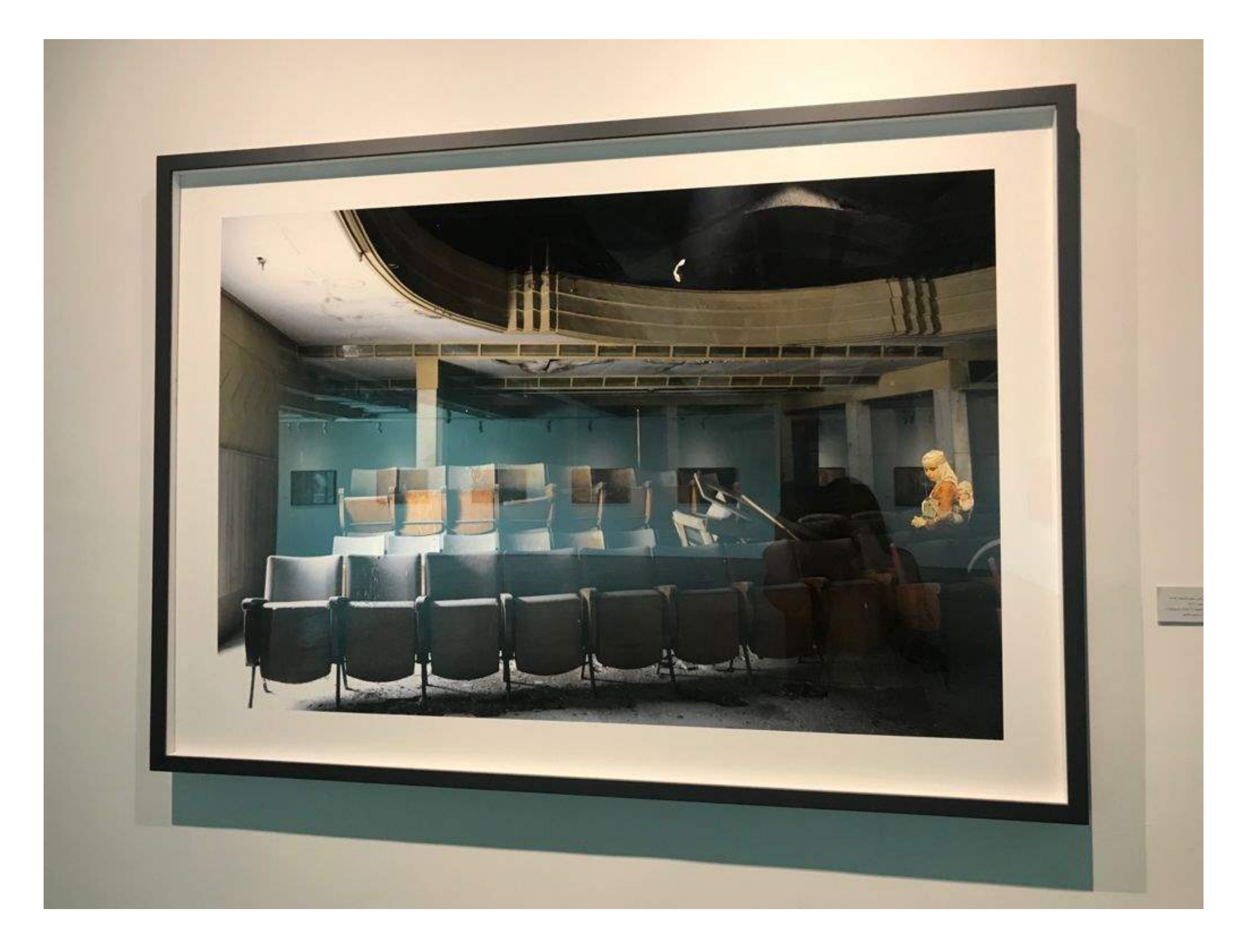
A collection of images from the Immobile Nomad photography exhibition by Italian photographer, Agnese Purgatorio.

"Image Festival Amman is a photography festival; this year there are 38 exhibitions in 17 different locations," Khoury said.